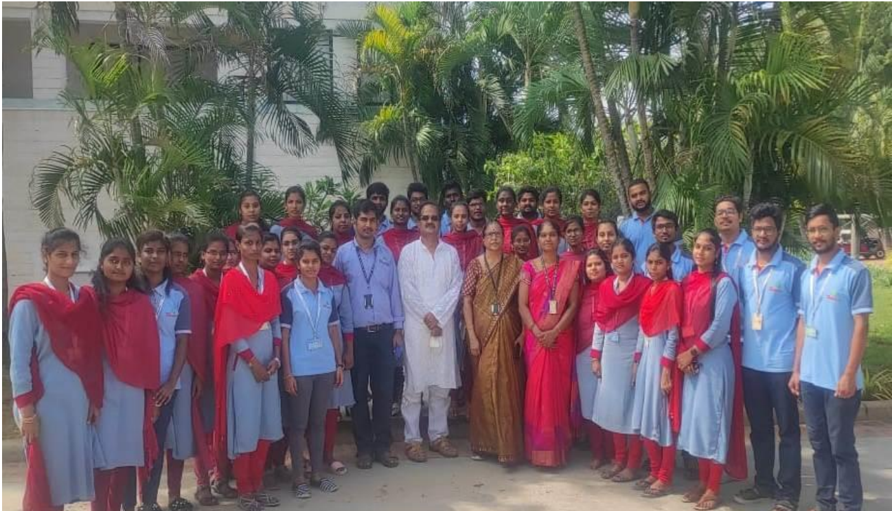
Placement crew with the students.