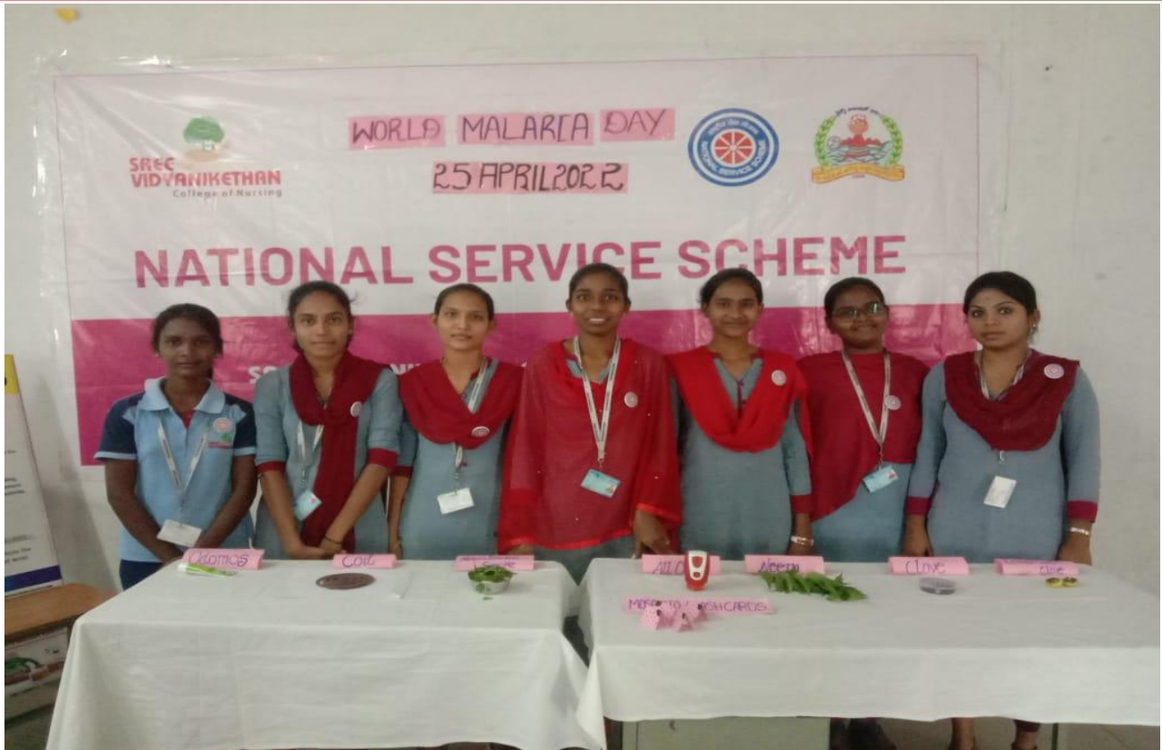
Students exhibit the measures to control mosquitoes