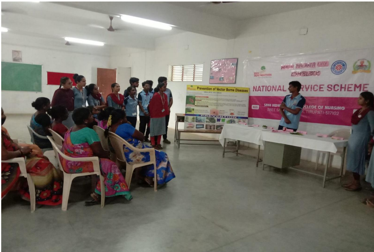
End of the program sanitaryworkers gained knowledge on measures to control mosquitoes and they got clarification from doubts.