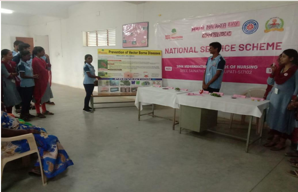
Students clarifying the doubts