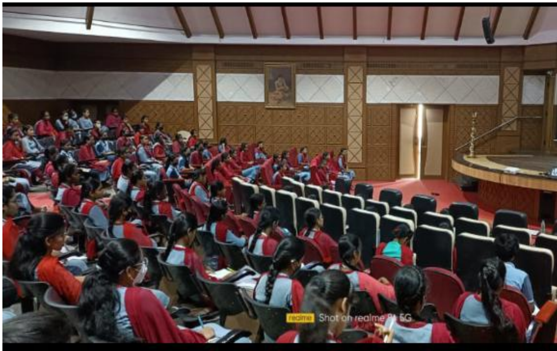
Pre-test and Post-test were conducted for III Year and IV year B.Sc Nursing students, SVCN