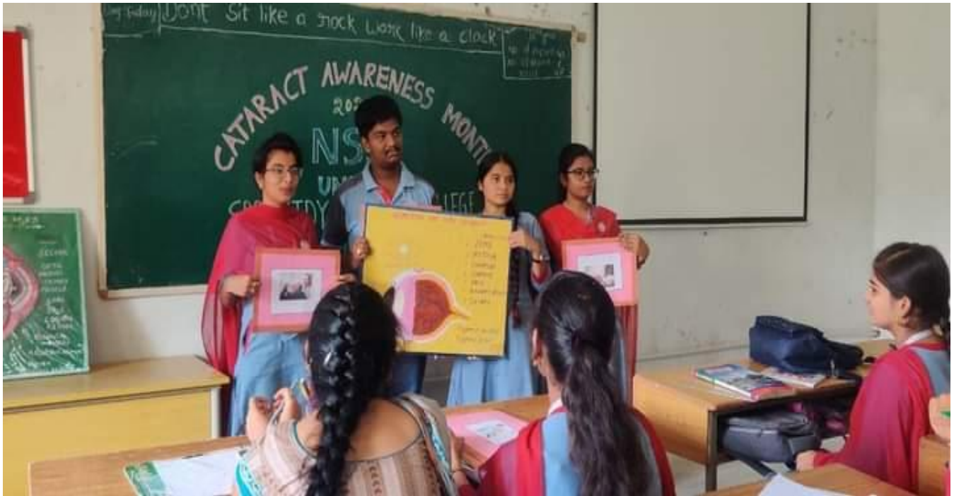
NSS Volunteers of Sree Vidyanikethan College of Nursing displaying the A.V. aids