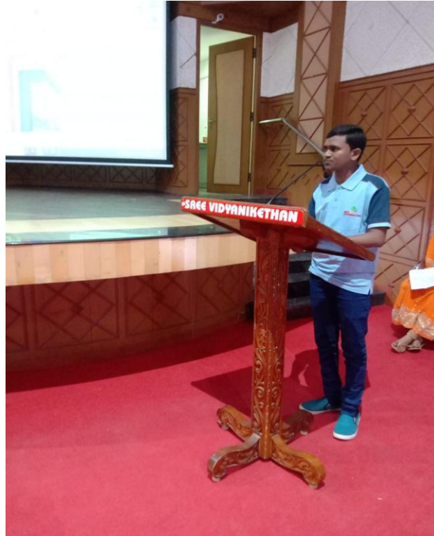
Students giving feedback about Nursing Process and CNE Program