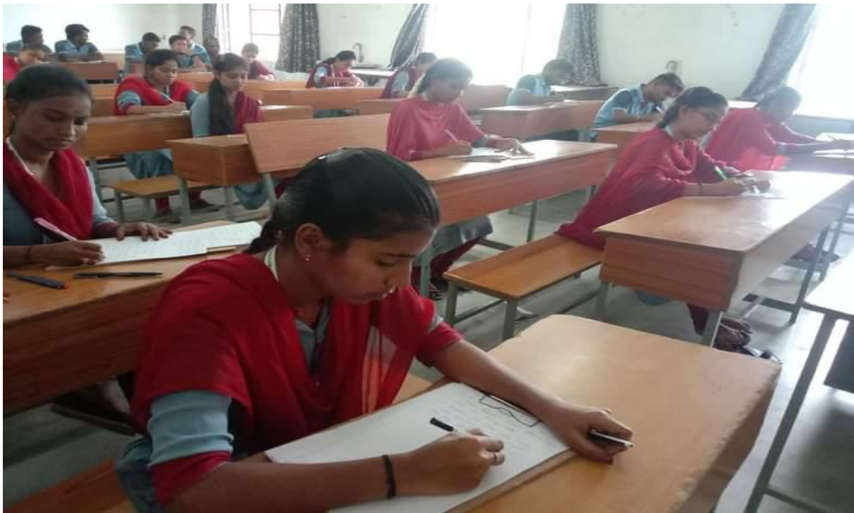
Volunteers involved in NSS activity