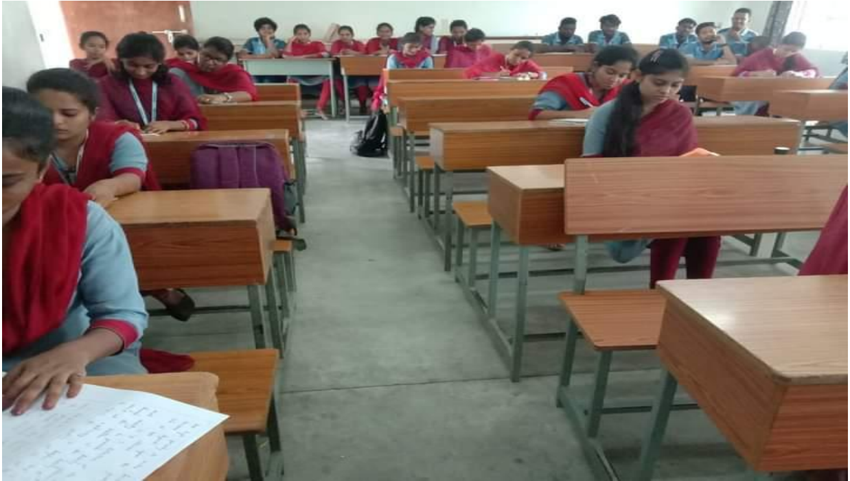
Students participated in an essay writing competition