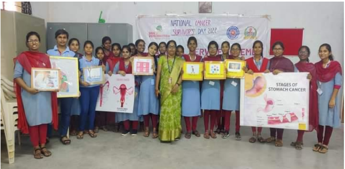
NSS Team exhibiting the A.V. Aids related to different aspects of cancer