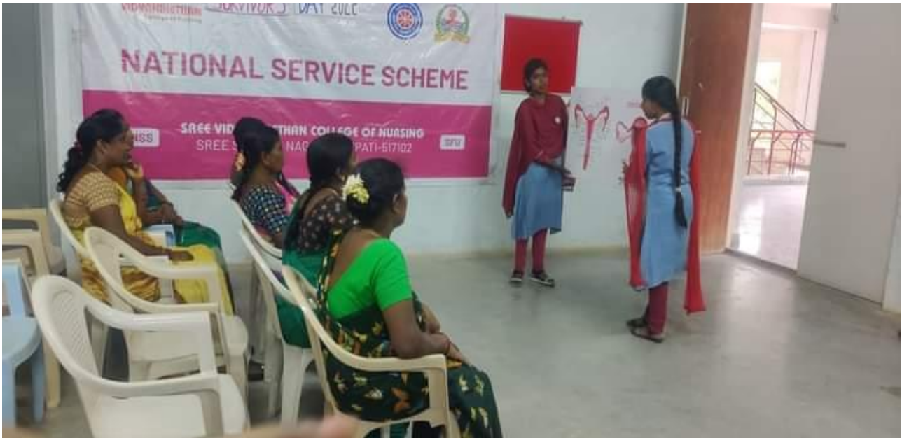
NSS Volunteers displaying the A.V. Aids related to cervical cancer