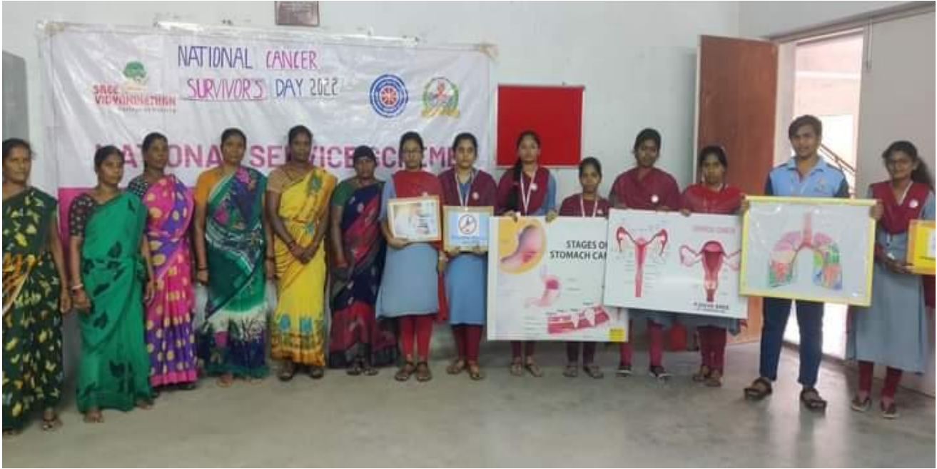
Students along with the sanitary workers