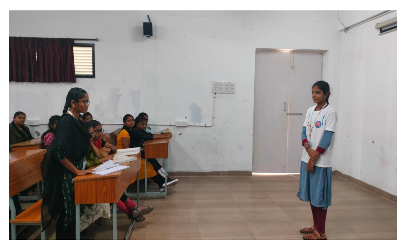
Doubt clarification session