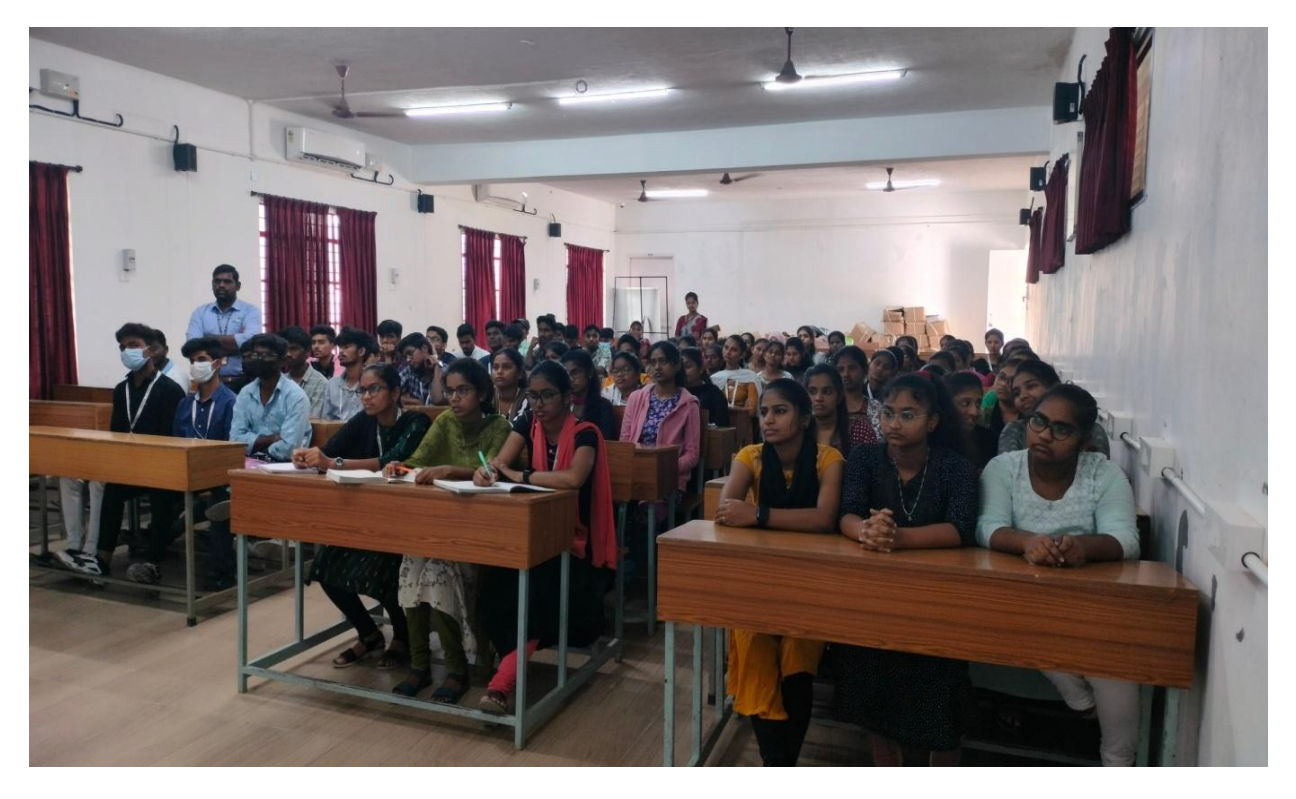
Students joined in INTERNATIONAL EPILEPSY DAY health awareness program