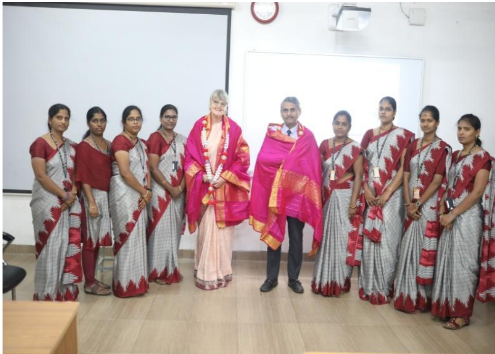
Group photo with Guest, Principal and all faculties of SVCN