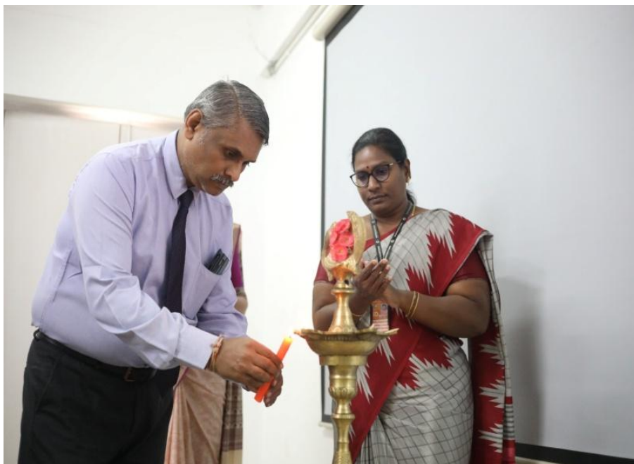
Lamp lighting by Special Guest with our Principal