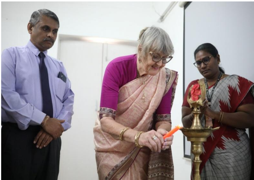
Lamp lighting by our Principal with Chief Guest