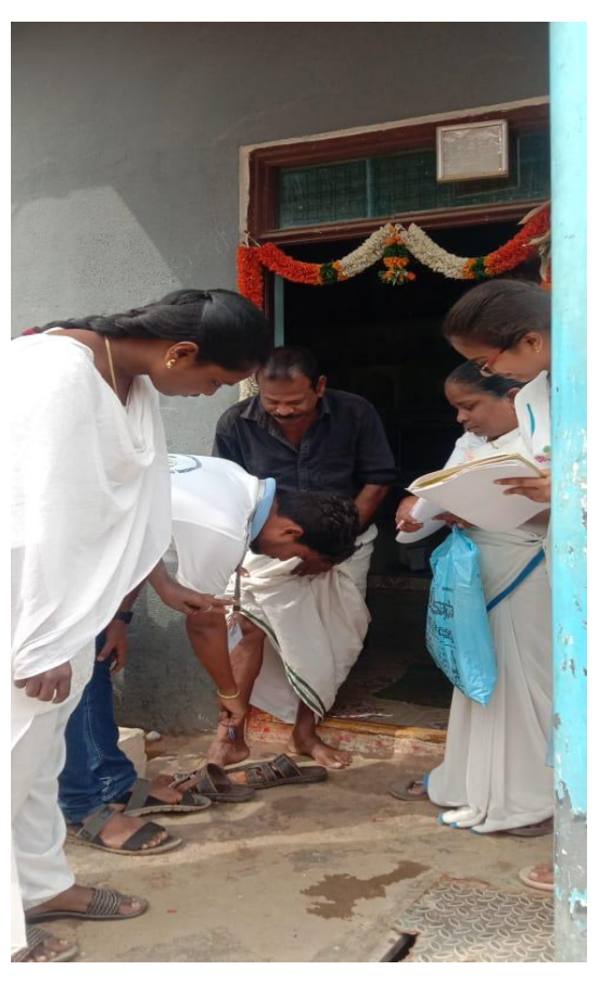
NSS Volunteers along with the ANM & ASHA performing the examination