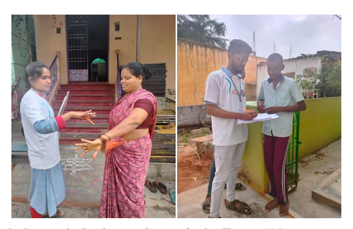
Students conducting the screening tests for the villagers at A.Rangampet