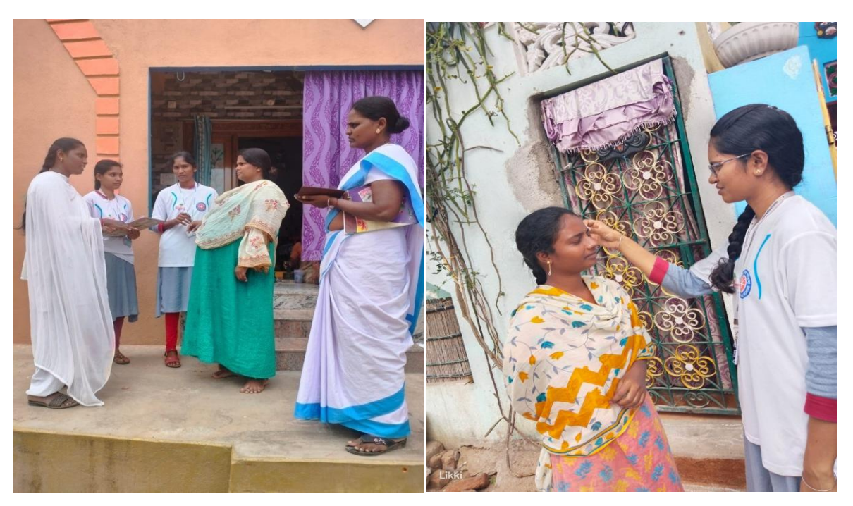
Students performing the awareness & screening tests