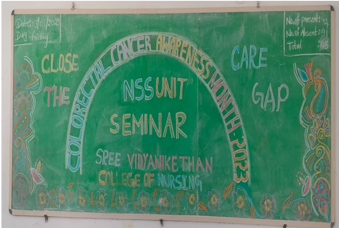
Conducting seminar for 1st Year B.Sc(N) students