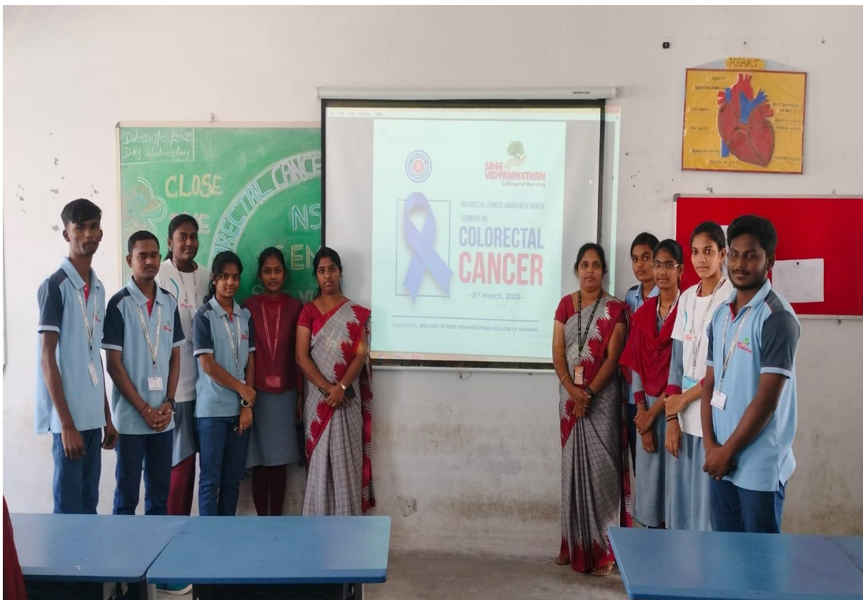
Students joined in COLORECTAL CANCER AWARENESS MONTH seminar program