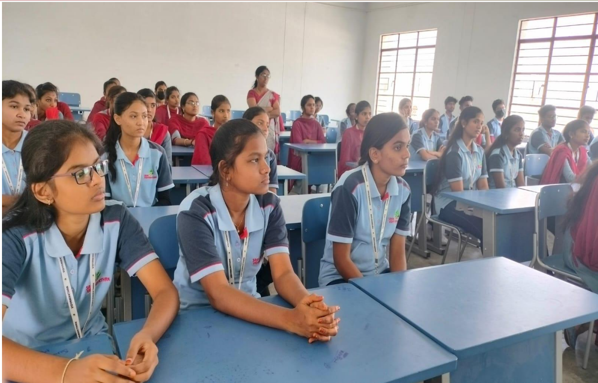
Students paying attention in the seminar