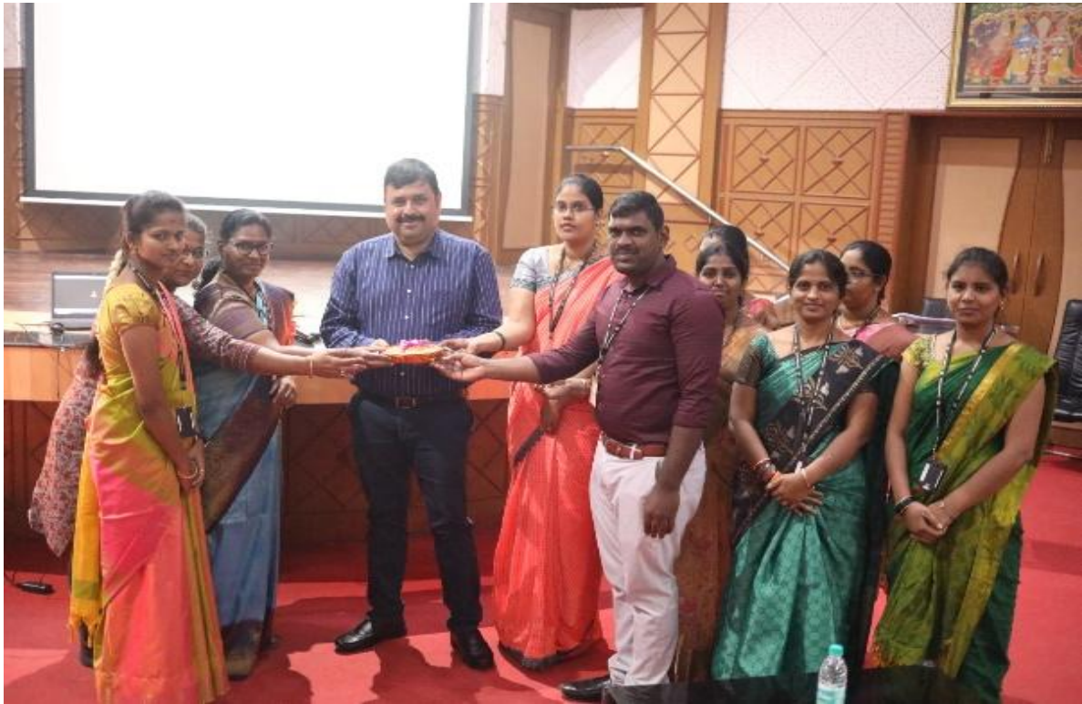
Felicitation for chief guest by Principal and all faculties of SVCN