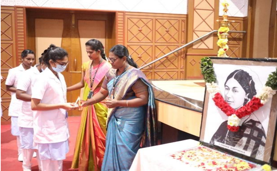
Lighting the lamp for students