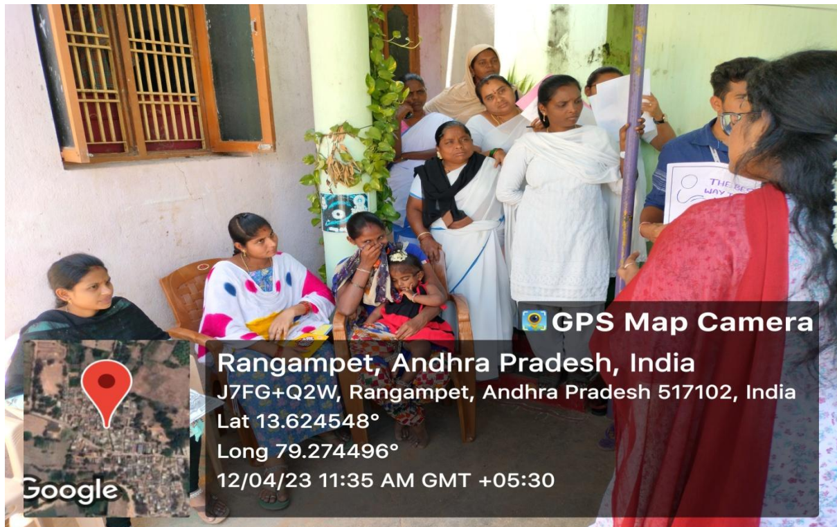
Antenatal mothers & Health care members paying attention towards the skit performance