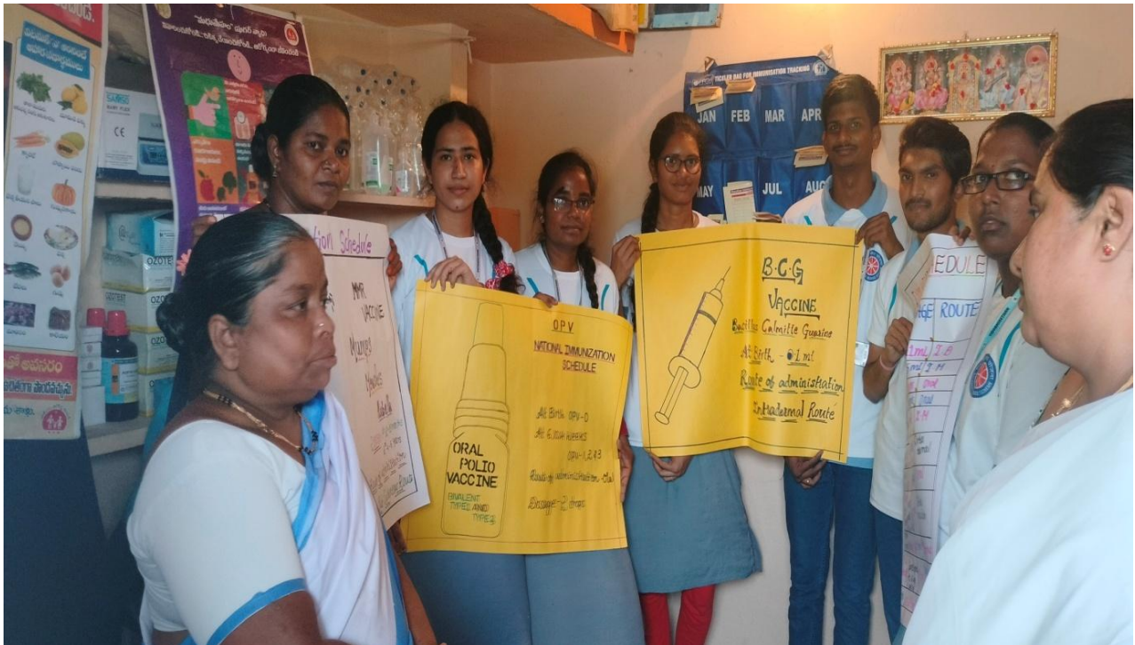
NSS Volunteers displaying the A.V.aids