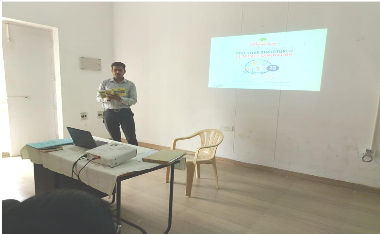
Faculty explained the practiced group assignment