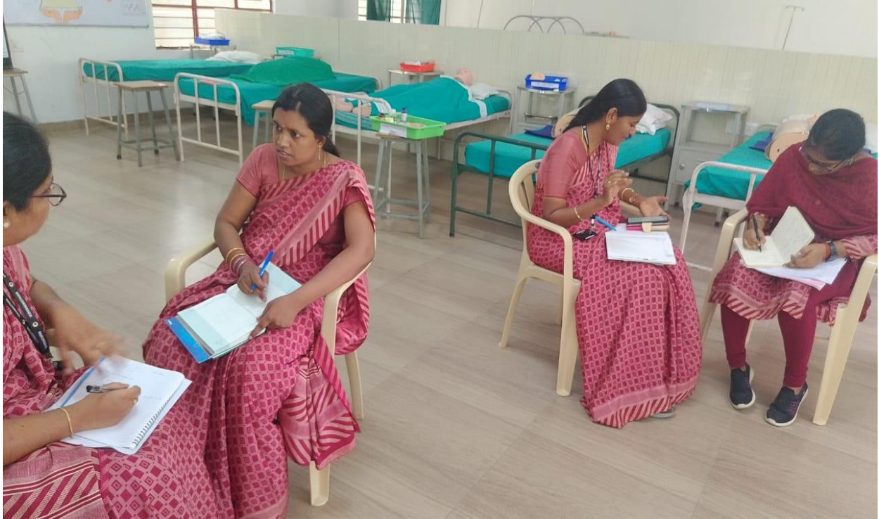
Faculty performing the group task in practice session