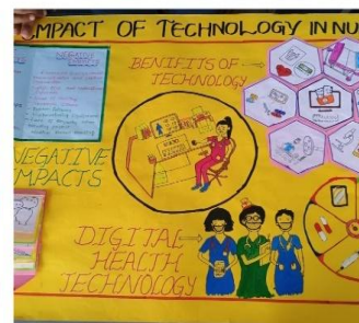
Different posters presented by students during Poster Presentation