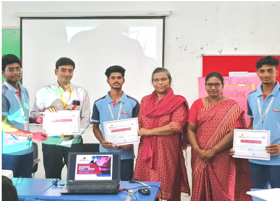
Chief Guests presenting the certificates to 2nd runner ups