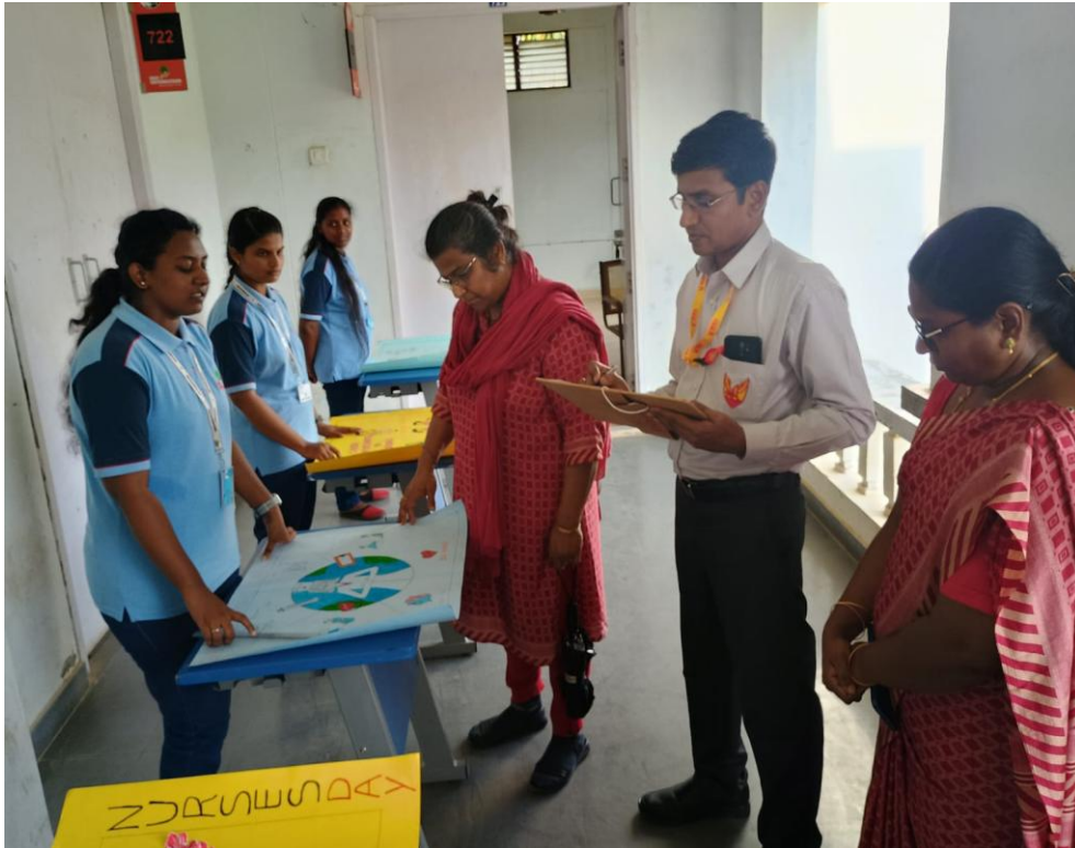
Poster Presentation by the Students