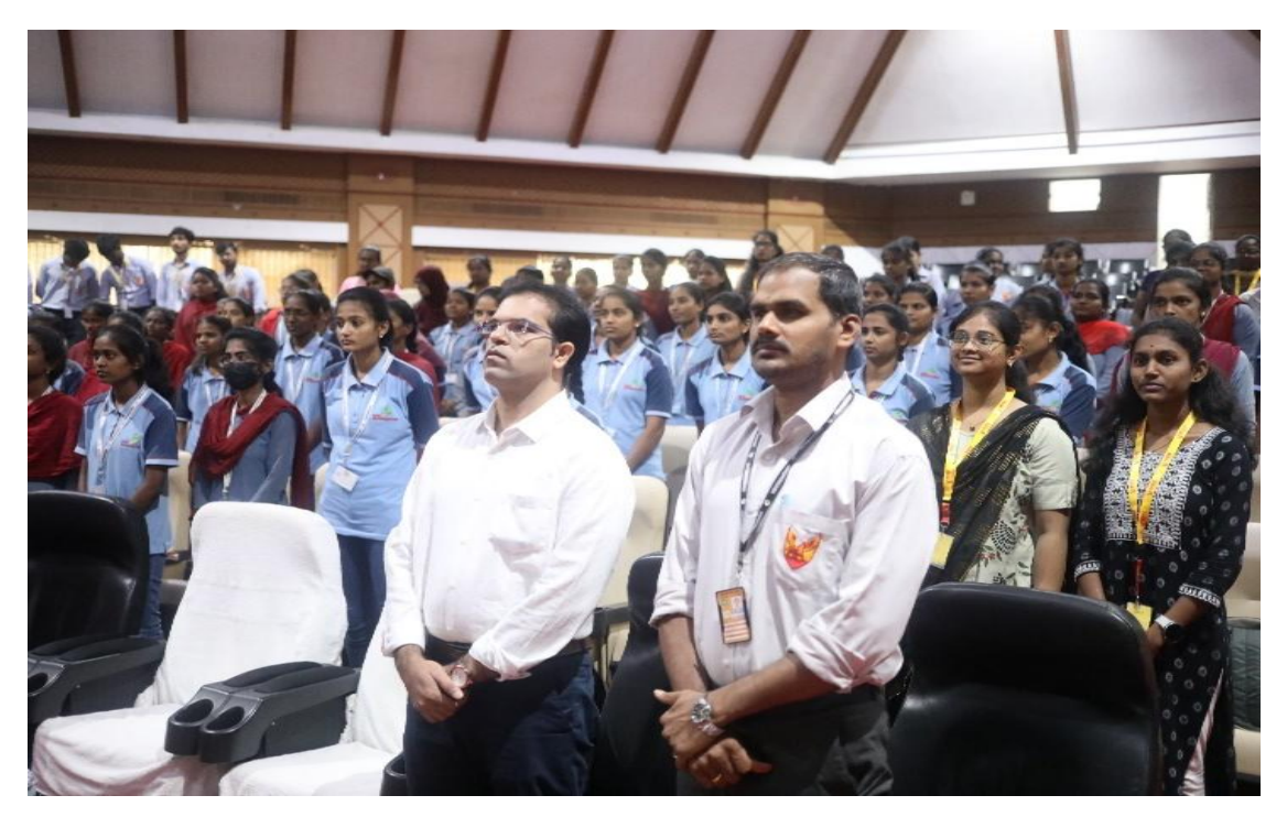
Students stand up for the prayer song.