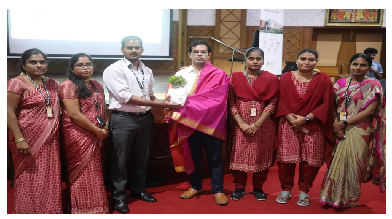
Faculty of SVCN along with the chief guest