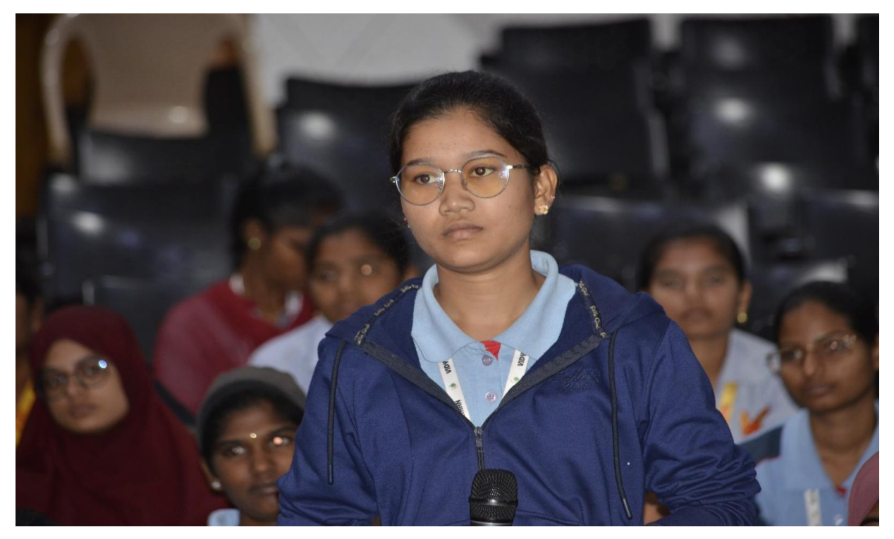
Students clarification session on vaccination for cervical cancer