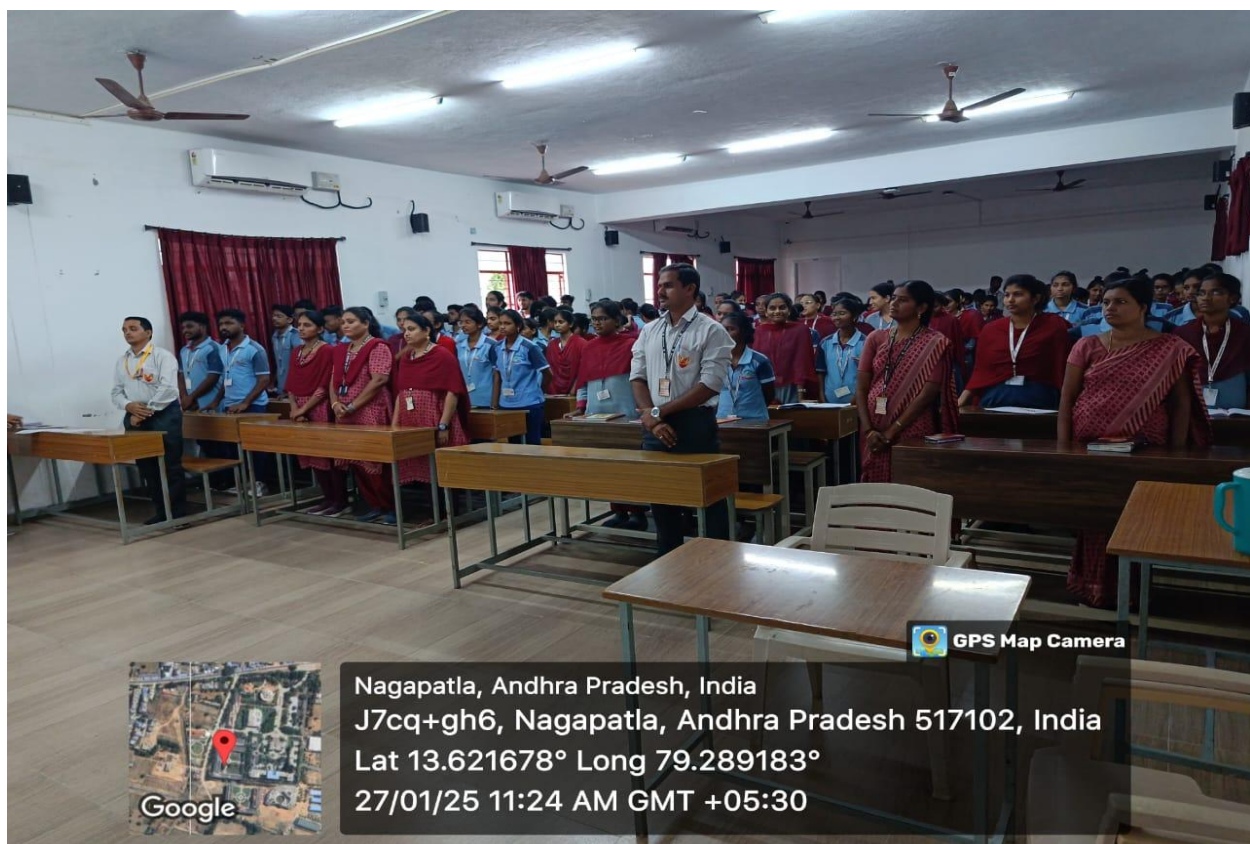
Faculty and Students standing for the prayer

SNA unit of Sree Vidyanikethan College of Nursing has organized a program on CURRENT NATIONAL HEALTH PROGRAMS as a part of HI-TECH HI-TOUCH CLUB ACTIVITY on 27.01.2025 at 11:00 AM – 01:00 PM at SVCN Seminar Hall. All the batches of B.SC(N) students have attended the program along with the faculty. The presenters have discussed about the various health programs currently implemented in India and the benefits of it.