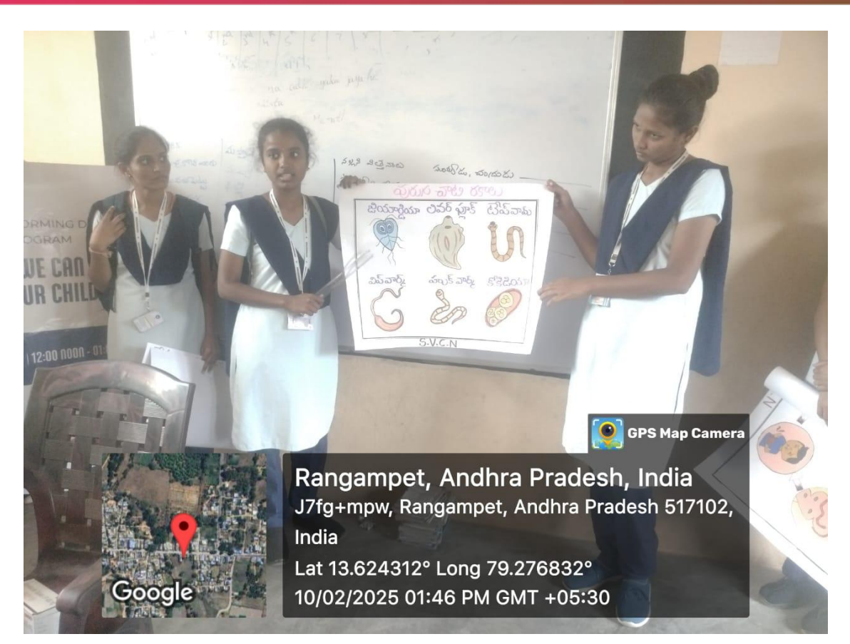
Students explaining the different types of worms

Totall 250 students are getting benified from various schools on the deworming day.