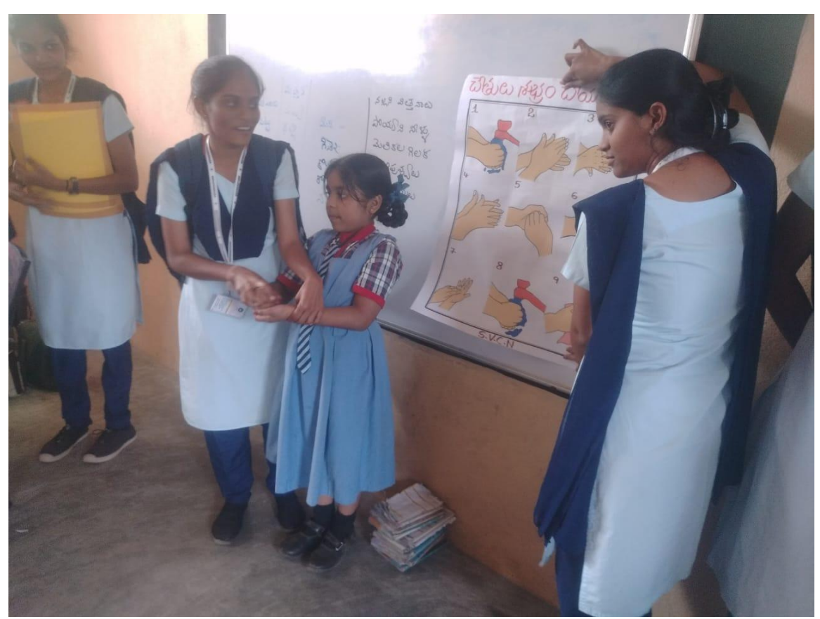
Hand washing demonstration to the students