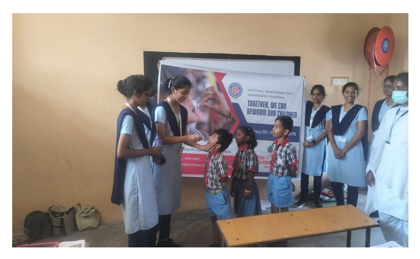
Students administred the albendazole tablets to the students