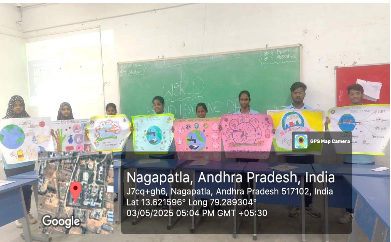
Students displaying their posters