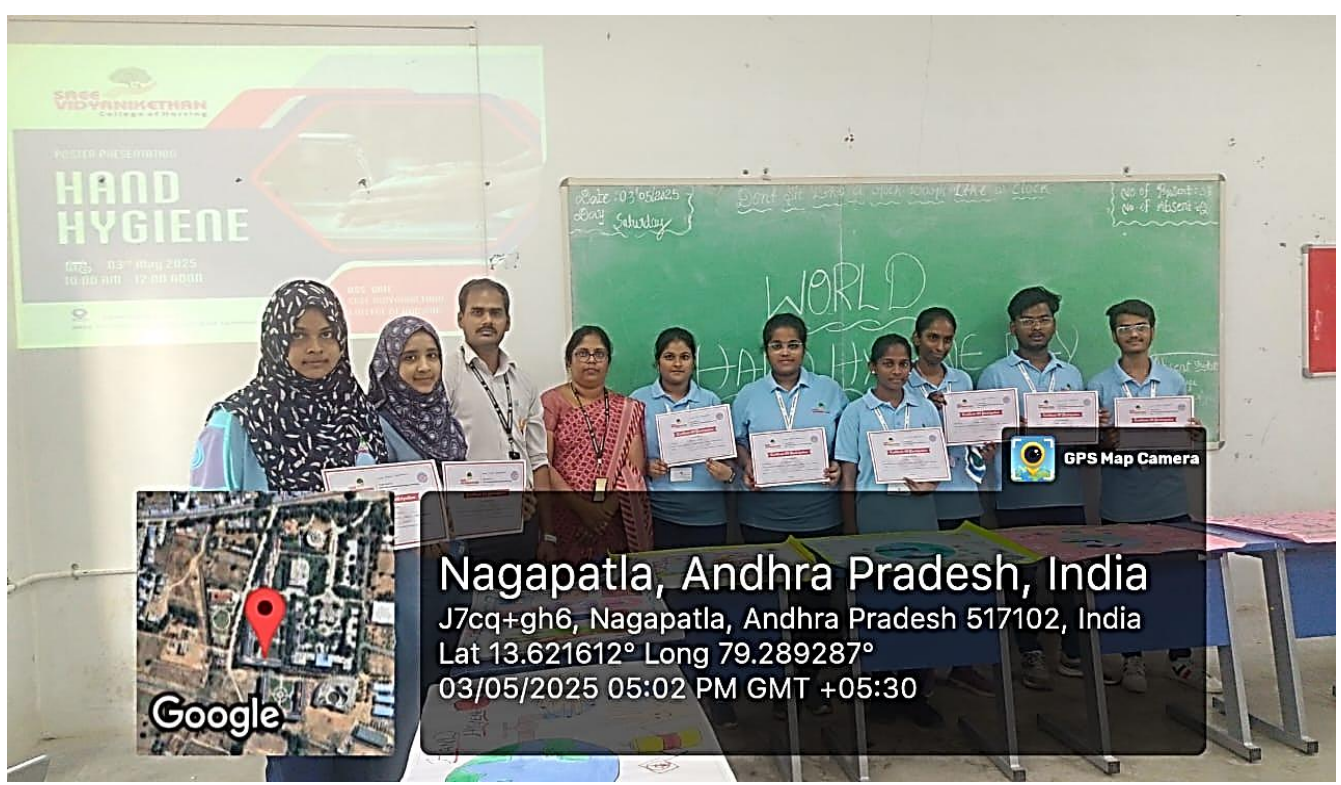
Students along with the Vice Principal & NSS APO