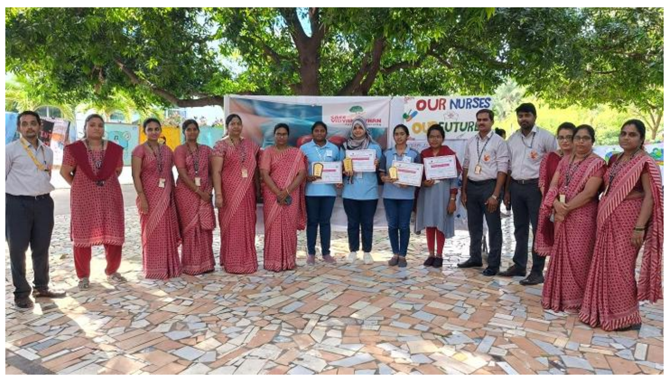
Winners of the poster presentation competition, along with the judges and faculty