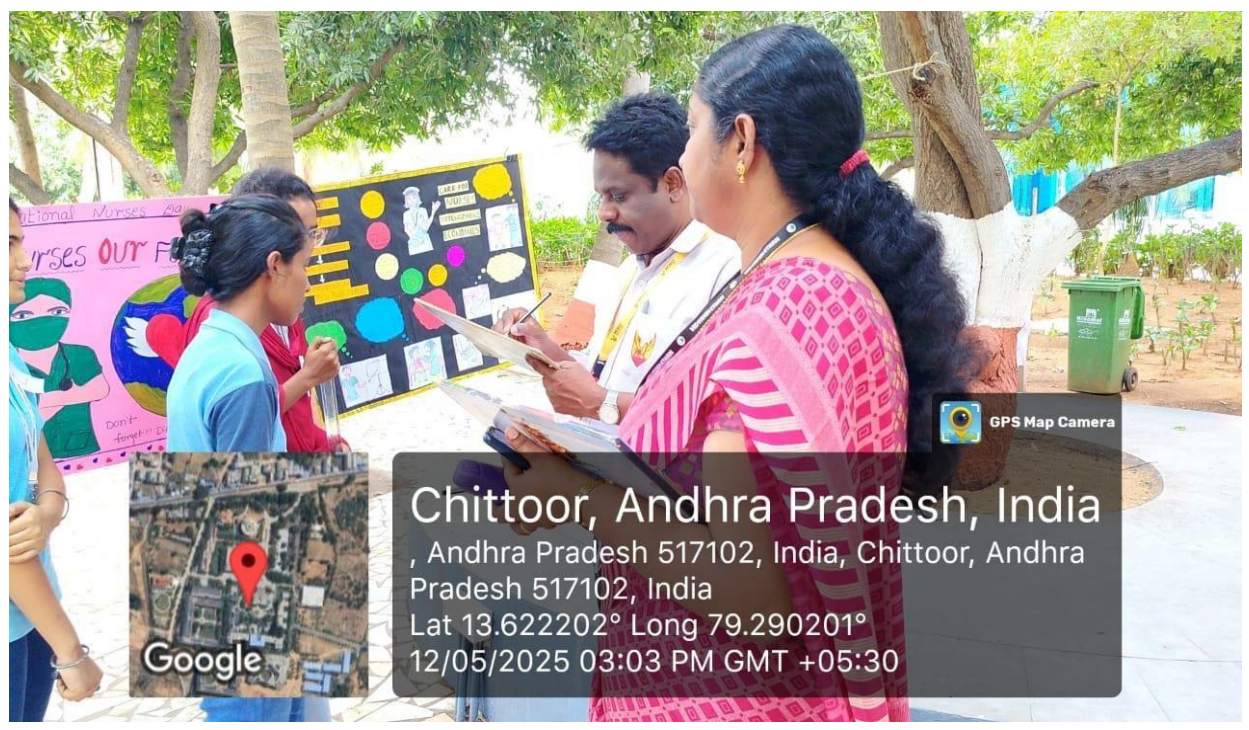
Judges evaluating the Students