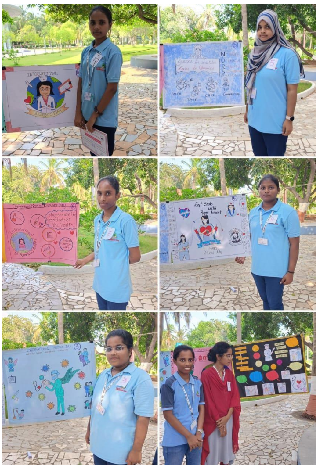
Students along with their posters