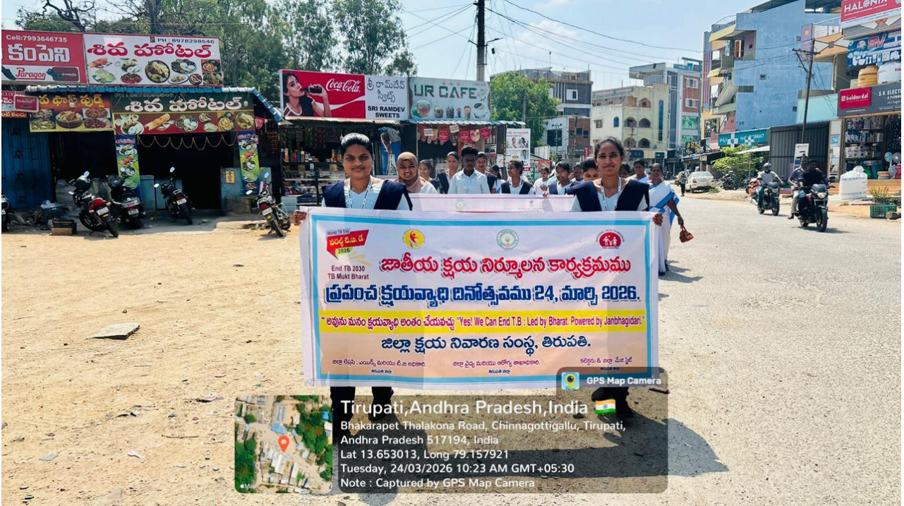
Health awareness rally at PHC, Bakarapeta