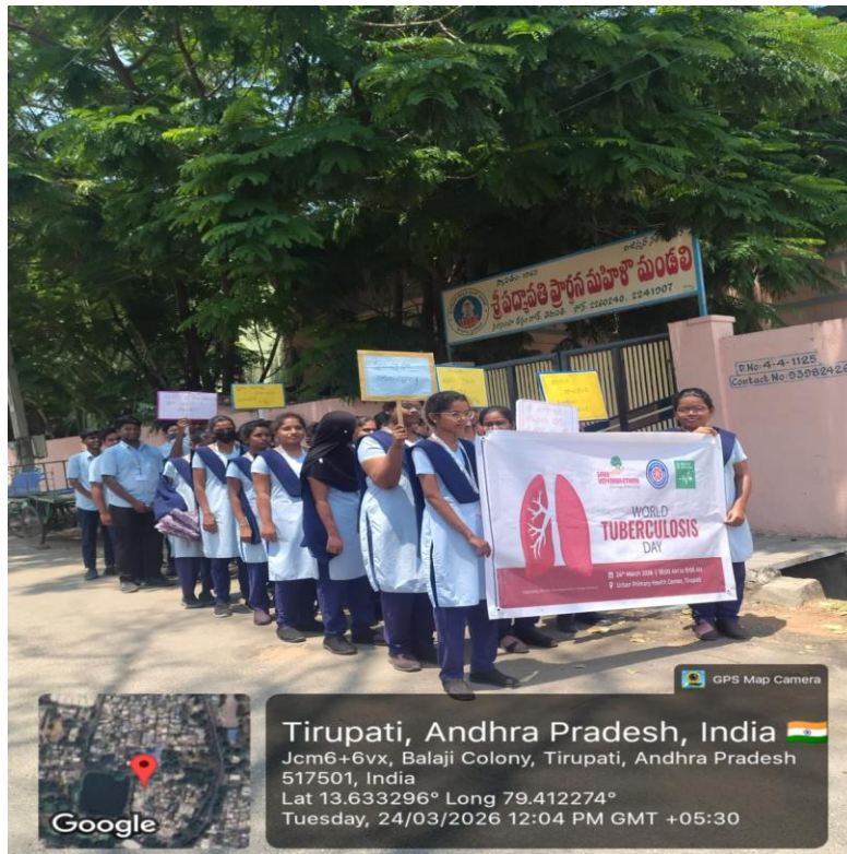
Students are showing the placards during the awareness program