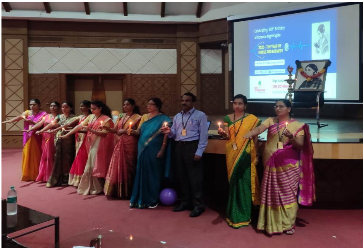
Principal & Faculty taking Florence Nightingale Oath