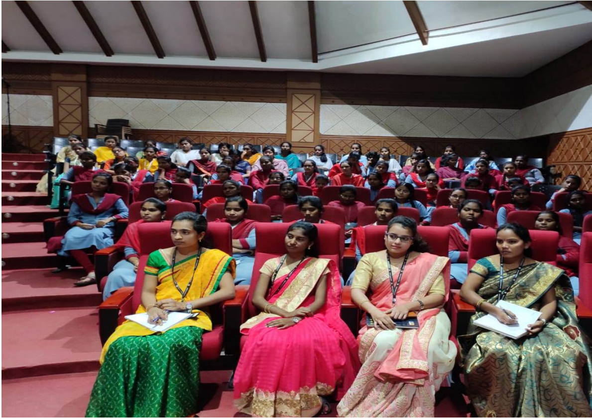
Members of Faculty and Students during the Program