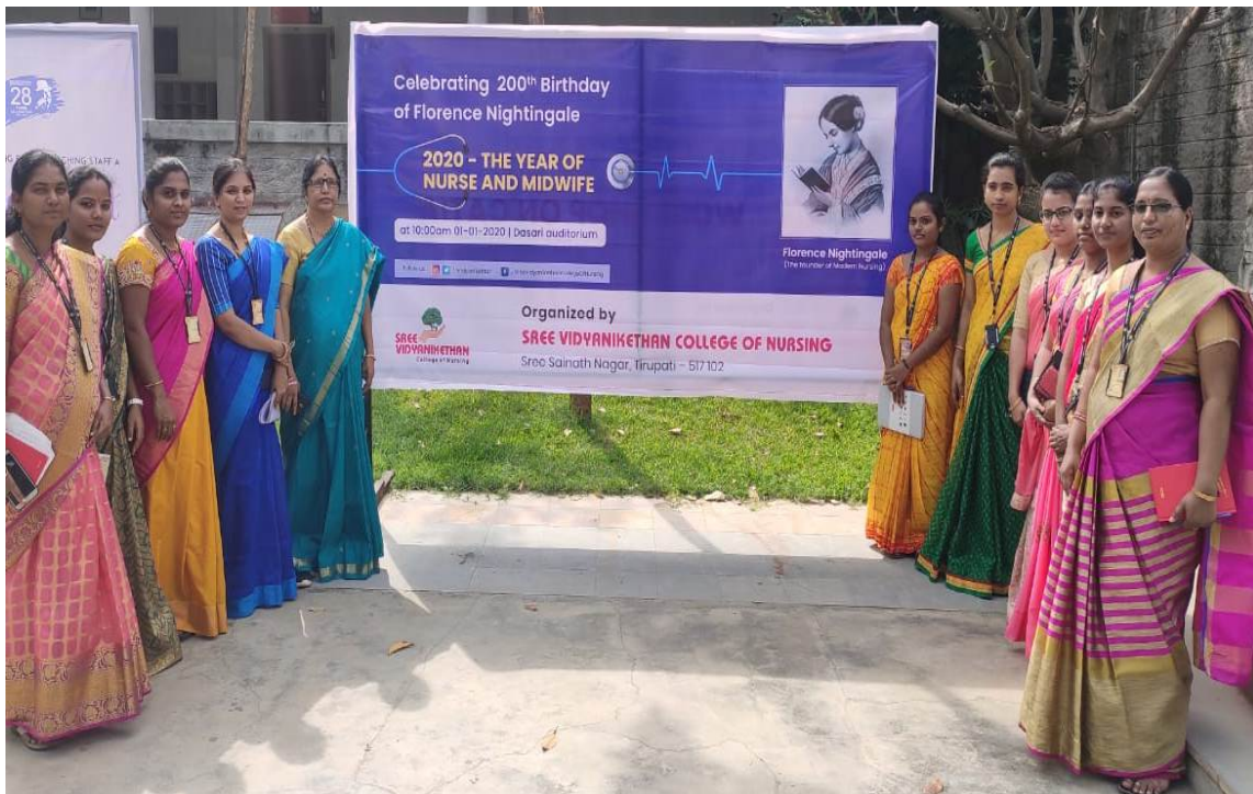
Principal and Faculty after the Programme