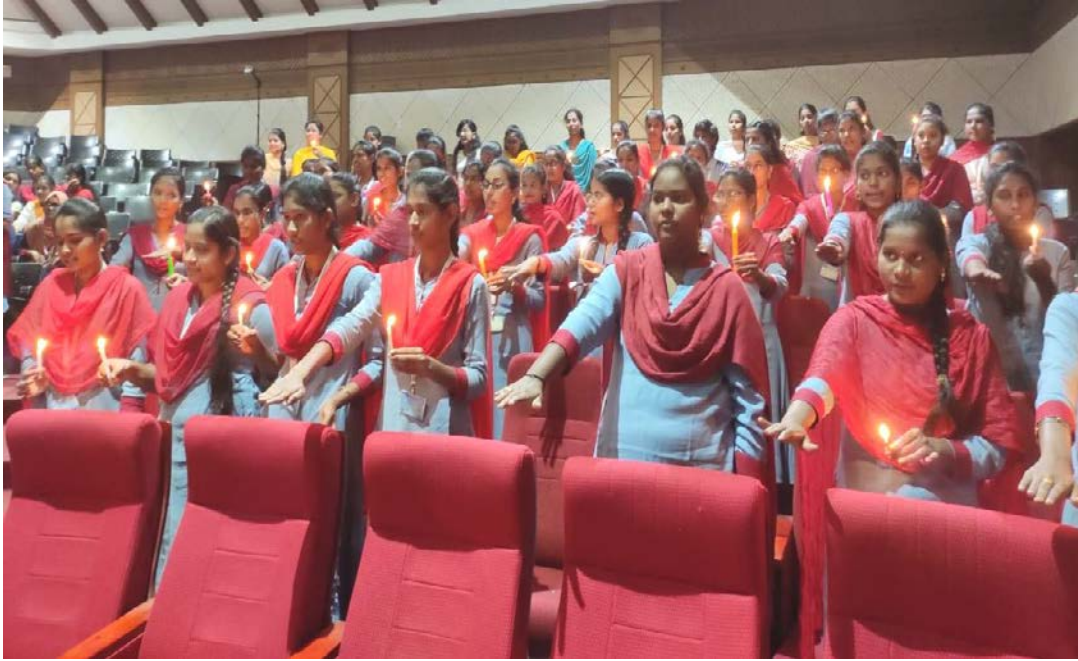
Students taking Florence Nightingale oath