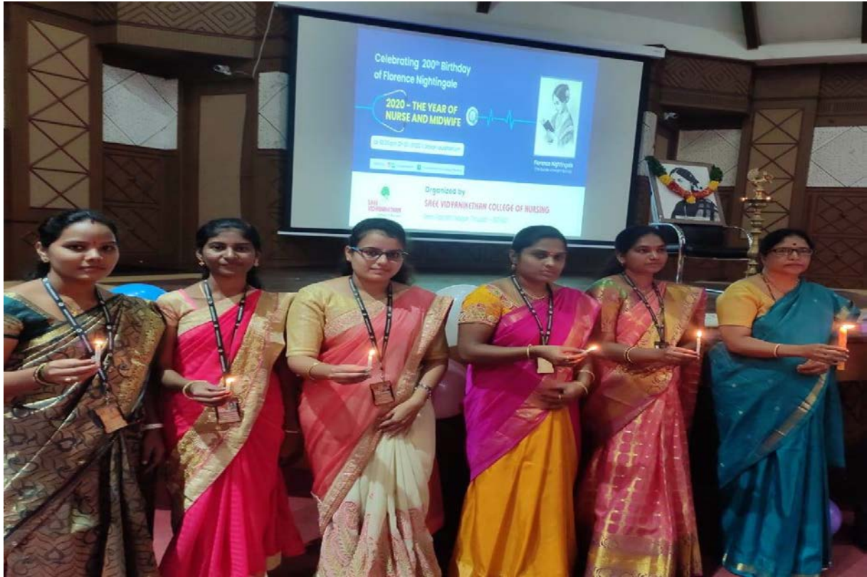
Nursing Faculty with the Principal, SVCN