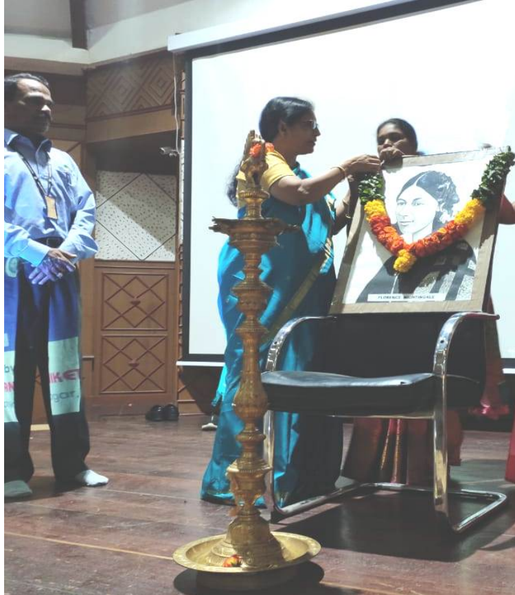
Principal , SVCN garlanding the portrait of Florence Nightingale