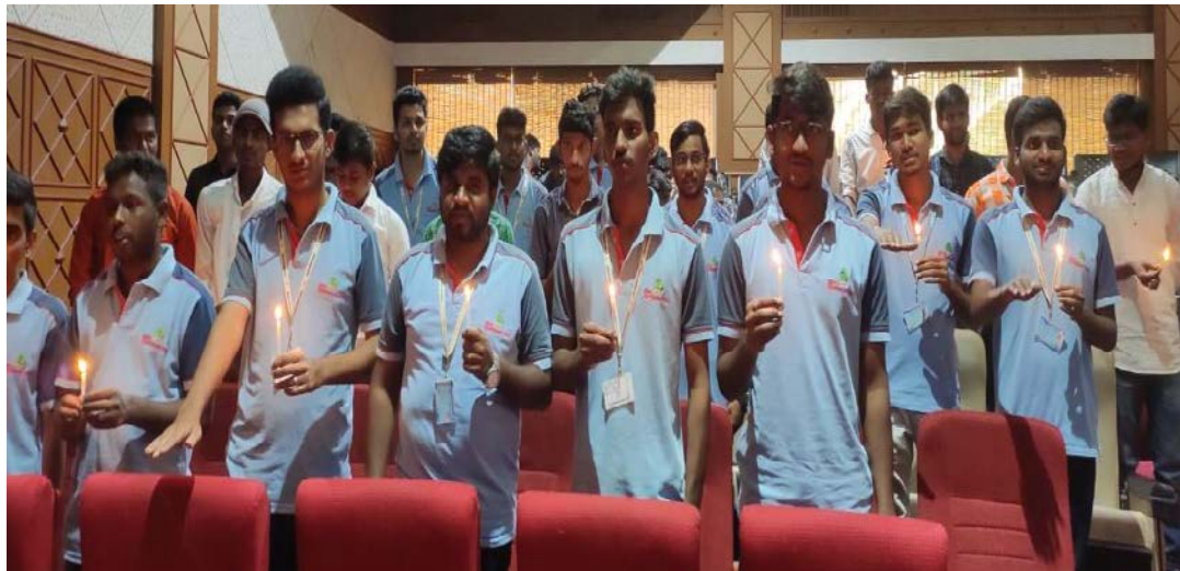
Students taking Florence Nightingale oath